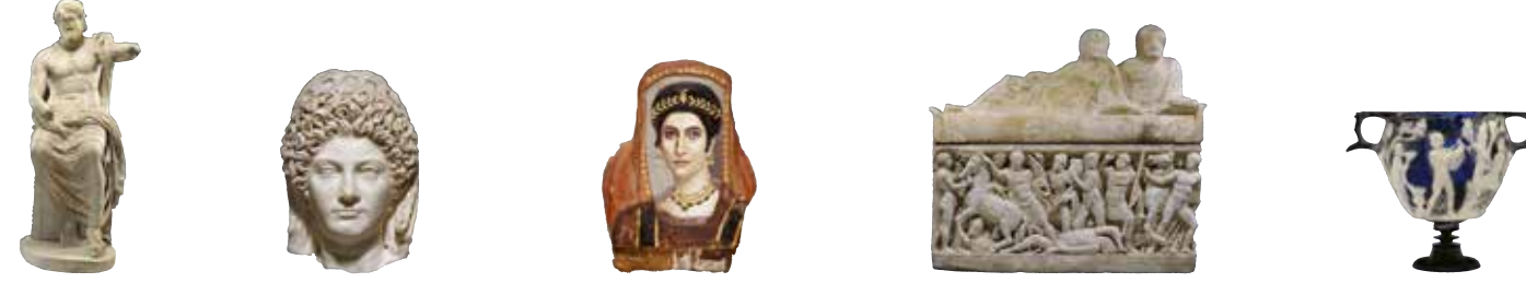
Gallery 207 Jupiter Gallery 209 Head of Julia Titi Gallery 210 Mummy Portrait of Isidora Gallery 213 Sarcophagus with Scenes from the Life of Achilles Gallery 214 Wine Cup with a Bacchic Scene