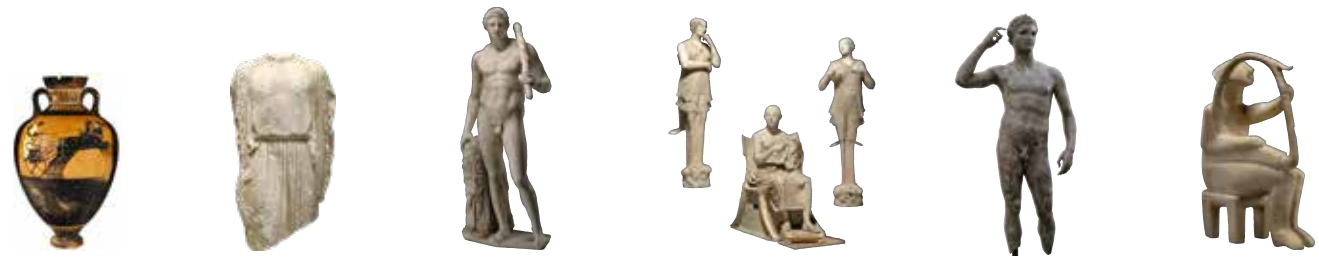
Gallery 103 Prize Vessel with a Chariot Race Gallery 104 Woman Wearing a Peplos Gallery 108 The Lansdowne Hercules Gallery 109 Orpheus and Sirens Gallery 111 Victorious Athlete (The Getty Bronze) Gallery 113 Harp Player